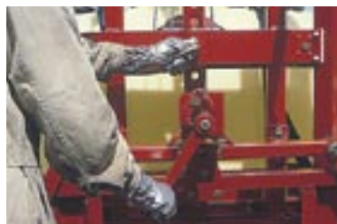
Manual boom lift