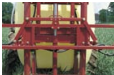
Hydraulic boom lift