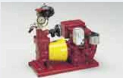
503 with direct drive unit